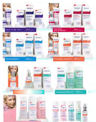
4 x 56 cm : Ref. 980050A