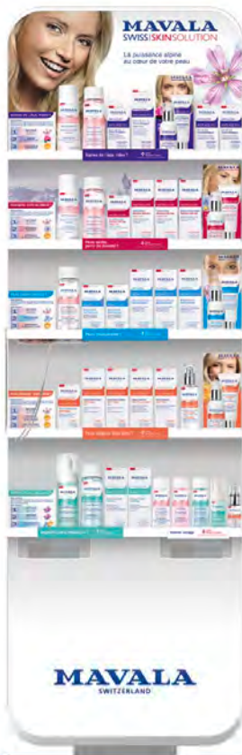
50 cm x 50 cm x 1m70 Ref. 980002A